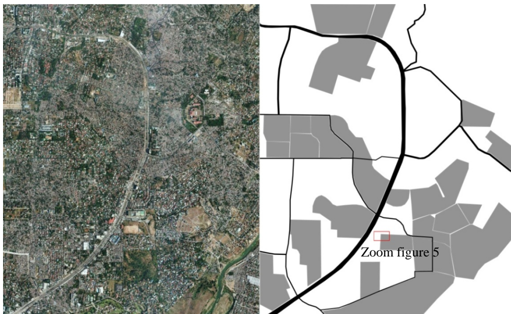
Figure 4. Map of Gated Communities next to Commonwealth Avenue, Quezon City

Quezon City, for example, was mentioned in the report of MMUTIS (Metro Manila Urban Transportation Integration Study, 1999) to have severe problems on accessibility due to the existence of gated communities. Figure 4 is a satellite image of an area nearby Commonwealth Avenue where a lot of gated communities have been developed. The analysis shows how private subdivisions provide obstacles for the city's mobility; the streets change direction to turn around closed areas characterized by access restrictions that strongly decrease the city's mobility potential.