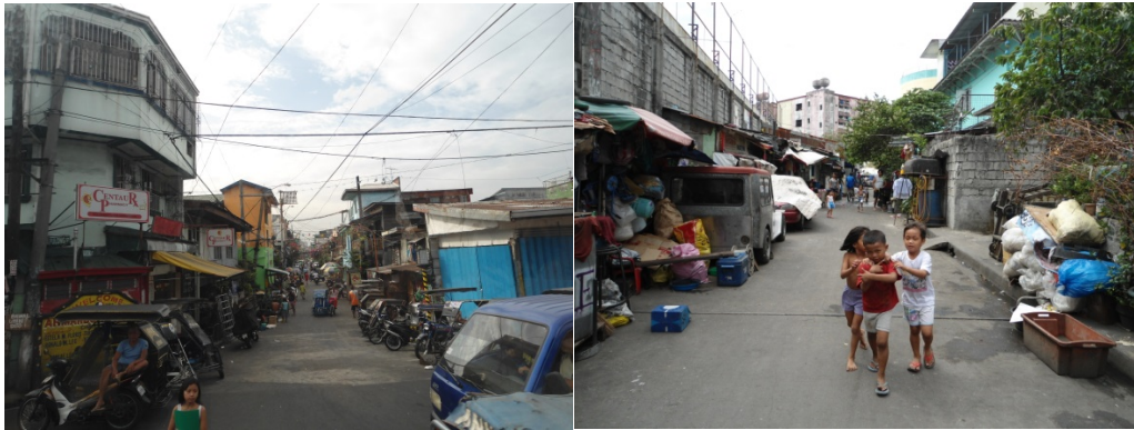
Figure 1 and 2. Open communities in Philippines.

Finally the garbage management and road maintenance is entirely dependent on the poor capabilities of the local authorities. (see figure 2)