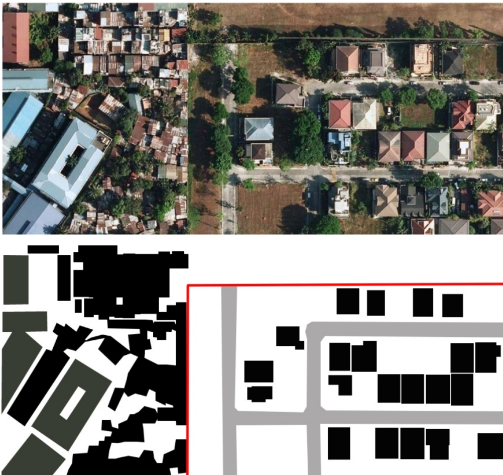
Figure 5. Zoom of Gated Communities next to Commonwealth Avenue, Quezon City

Figure 5 shows the difference between the pattern of houses inside and outside the gated community and how the walls cut every connection in between. No one except the inhabitants of the closed neighborhood can enjoy the peaceful atmosphere and the order created inside the walls. This practice of exclusivity causes social injustice because it connotes the segregation of society. In some ways, the restrictions in the form of gates and fences around neighbourhoods represent more than simple physical barriers, they manifest tension between outsiders and insiders, and the major problems of the city are left to the outsiders. This form of community development, as an enclosed neighborhood, has various issues contradicting the UNDP's propositions (United Nations Development Programm) for better Asian Cities. It does not help to reach the goal of poverty reduction and is against a democratic governance and sustainable development.