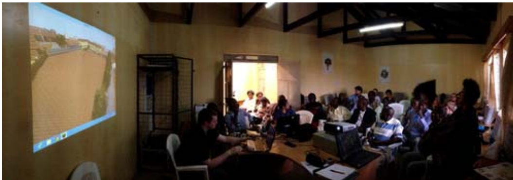
Presenting the Minecraft model to the participants

Development Network and will go on for four years (2012-2016), with the goal of upgrading 300 public spaces all over the world within the project time. The first pilot project was tested in the Kibera slums, the biggest slum in Nairobi, Kenya, and one of the largest in the world. The project surrounded the upgrading of the only available public football field and its surroundings in Kibera, and was a cooperation between Nairobi City Council, UN-Habitat and a number of community groups and organisations. The aim was to promote shared use, security and entrepreneurship and to work closely with the community (Block-by-Block, 2013).