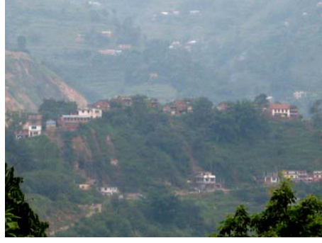
View of the Putuwar Village

It can be one of the tourist place, as people are living in the traditional way, they have not lost the culture heritage they have and because of its location. Bhairab temple is within this village, which is important to be conserved. Goddess and the related dance are main part of the festival called Indrajatra (festival of living goddess in the centre of the Kathmandu.)