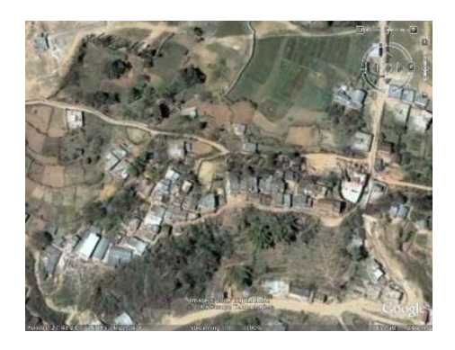
View of the Putuwar Village

It has a population of 462 (male = 236, female= 226). Ethnic group Putuwar and Tamang live here.