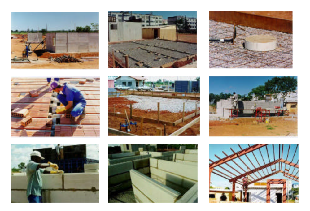
Figure 3: Examples of photos taken during the building process

All the information collected will be given to the Institute/ University contracted to carry on the evaluation process. An agreement between the local government and the National Bank – CEF is being negotiated and has the Ribeirão Preto's Vila Tecnologica Evaluation developed by the ArcHtec research group as a reference for the evaluation to be carried on the Federal District Vila Tecnologica Project.