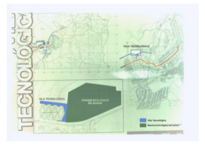
Figure 2: Location of the project

The Project is strategically located in an area between the Pilot Plan (city core) and some of the most important satellite towns, so that a great number of people could easily reach the area to visit it.