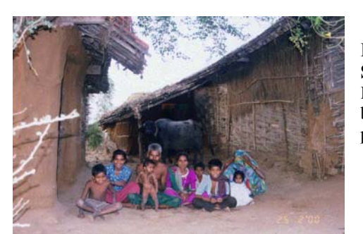
People's Participation in Selection of New Habitats It was well realized from the beginning that participation of people is most essential in decision

As per today, out of total 40,727 families, refer Table 1; SSPA has resettled 19,684 families on the newly built 180 habitats. Earlier SSPA was building the habitats, but now the work is assigned to various NGOs and it is faster and more efficient. The author visited some of these sites recently to get the response of the people, and it is found that people, by and large, are satisfied and have improved their income and living standard over the last 10 years.