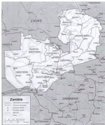
Figure 1 – Map of Zambia