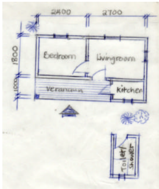
Figure 2. Example of the smallest house built before 1956.

The houses were highly subsidised and were priced according to their age and the state in which they were. For instance, a small house which was built in 1956 or earlier was sold at as little as K 10,000 an equivalent of 3US$. An example of the smallest house with One (1) Bedroom that was sold at this price is shown in figure 2. This amount was just for the paper work to change hands from that of the local authority to the beneficiary. This was in line with the strategy to empower the low-income people in the country and who were the most living in these old dilapidated houses. Others which were built much later and are bigger in size with Bathroom and Toilet indoors were sold for about 150US$ - 1800US$.