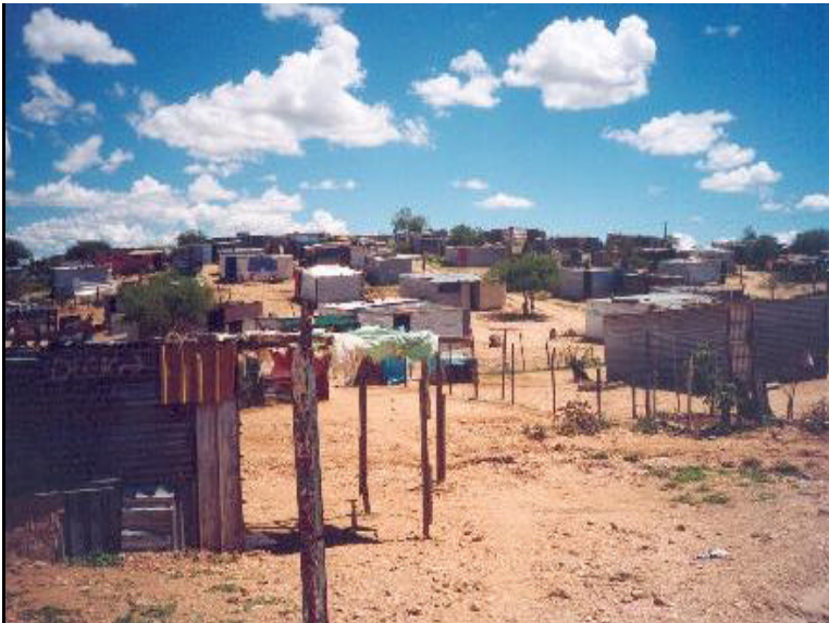
Figure 3 An informal settlement area in Windhoek, Namibia

In practise, this meant that the beneficiaries would have to be in possession of an erf before applying for a loan for the construction of a top structure. Before the loan is granted, an approved building design should be submitted. Either the City provides this as standardised plans or the beneficiary can appoint architects. The City pays the fees of the architect, provided that plan is on accepted standard, approved and the claim is not exceeding the prescribed tariff. The beneficiary should then contract a private company for construction services or do the construction him or herself.