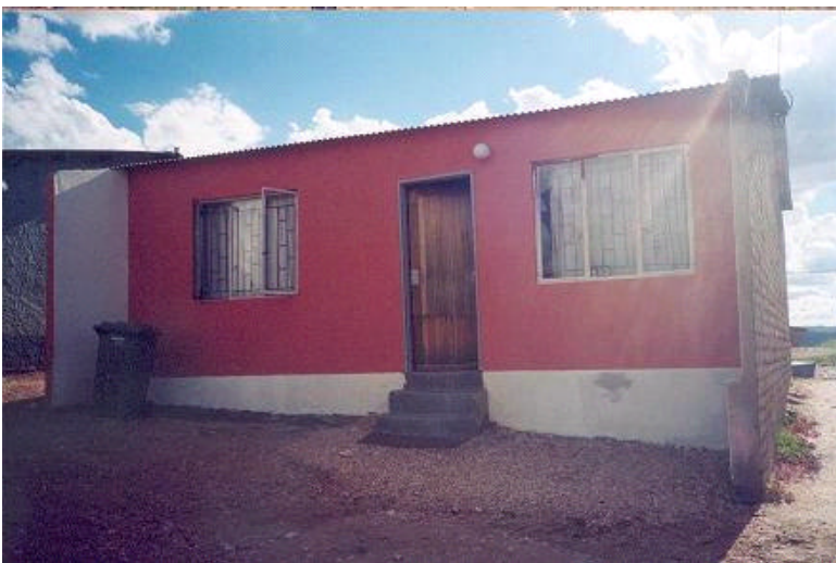
Figure 4 A typical low cost top structure in Windhoek, Namibia